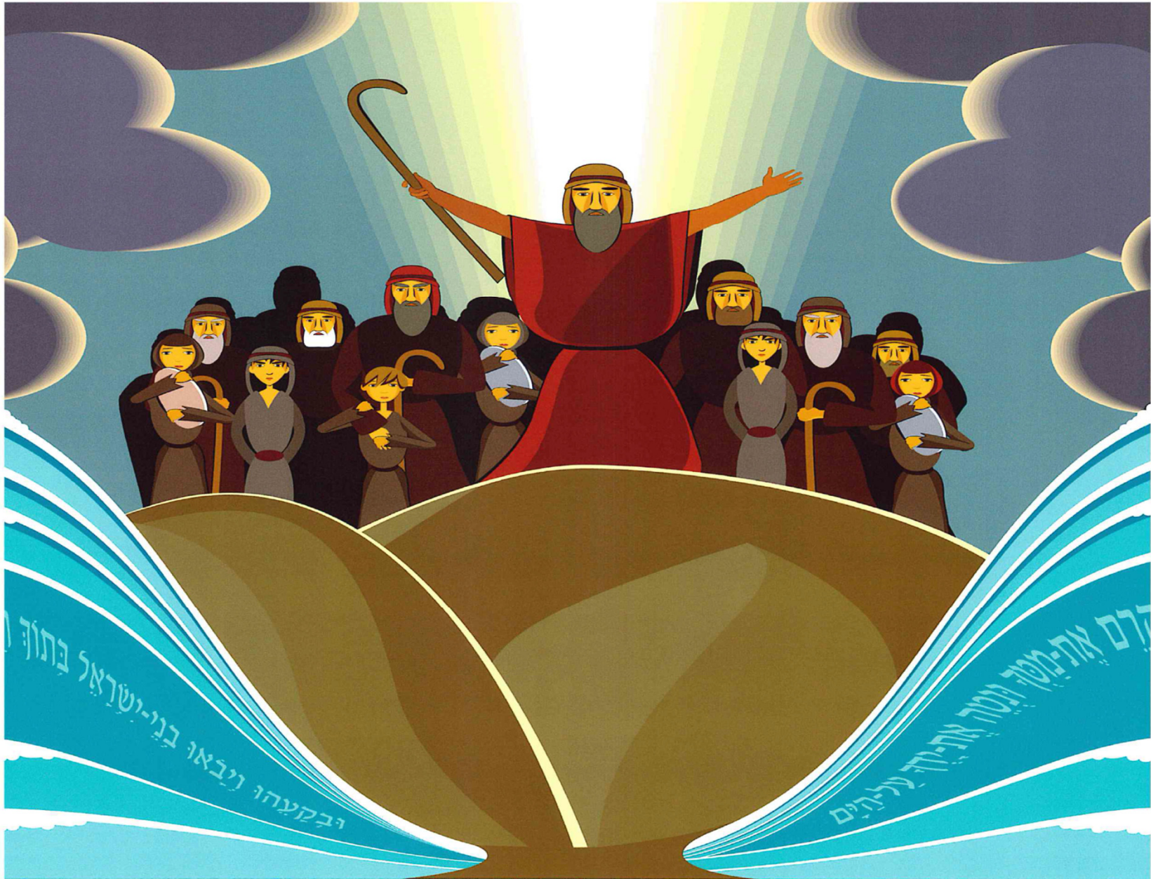
Question 17. How did God keep this covenant?